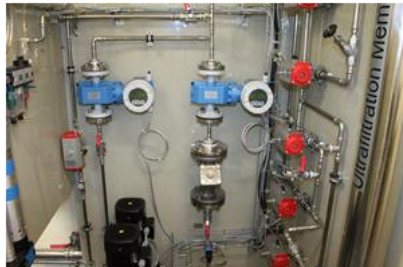
APATEQ delivers first plant with its proprietary oil-water separation technology into an oil & gas field

The Luxembourgish water and wastewater specialist expects extensive follow-up orders after successful field tests of the initial unit, which requires almost no chemicals for operation using a proprietary technology. The pilot plant is mounted in a 40-foot container for mobile use at different deposits, and it will be delivered this week.